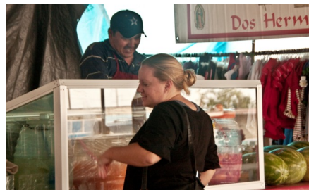
Above: Me at the Flea Market