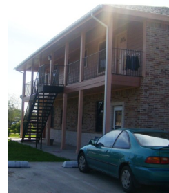
Left: My Car & the apartment building where most of us live My apt. is the one on the top right